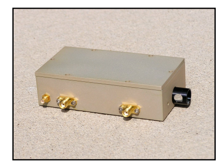
Figure 2: Models 10, 11 and 10P series Modulators

* Fitted with single 50 ohm SMA connector