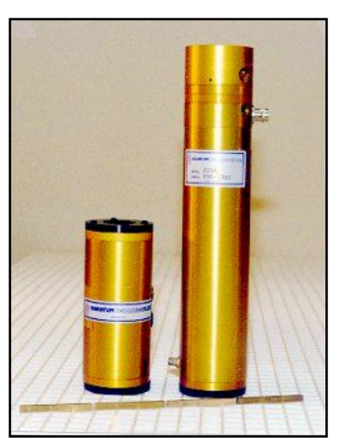
Figure 1: Models 12, 13, 14 and 15 series Modulators

available with full accessories. These include wideband E-O driver electronics, auto-bias controls, feedback networks, polarizing optics and modulators with bandwidths up to 1000 MHz. These systems offer the widest selection of integrated drivers and E-O modulators for optical bandwidths from UV (Crystal BBO down to 200 nm) through to the mid IR (4500 nm). BBO is an excellent crystal for use in the UV, KD*P in the visible (300 nm to 1100 nm) and Lithium Tantalate (LTA) in the mid IR region (600 nm to 4500 nm). These LTA modulators are transverse devices in which the electrodes are applied along Z direction and beam passes along Y direction of the crystal. Quantum Technology designs and manufactures custom modulation systems with BBO modulators in the UV or special band widths DC to 100 MHz or 1 MHz to 1000 MHz. CW power density should be limited to 200 W/cm<sup>2</sup> at 1064 nm and about 0.1 W/cm<sup>2</sup> at 633 nm for 0.8 mm beam (LTA crystals).